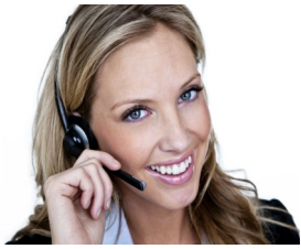
STAR: Screening, Triage, Assessment & Referral 1-866-998-2243

Ventura County Behavioral Health's centralized processing arm is called the STAR Team. Screening, Triage,